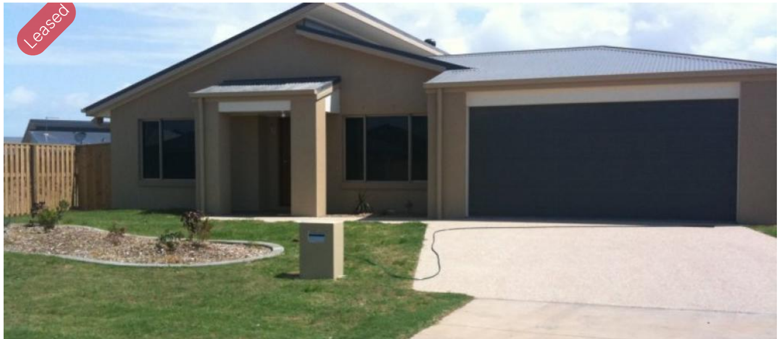
13 Miami Terrace, Blacks Beach