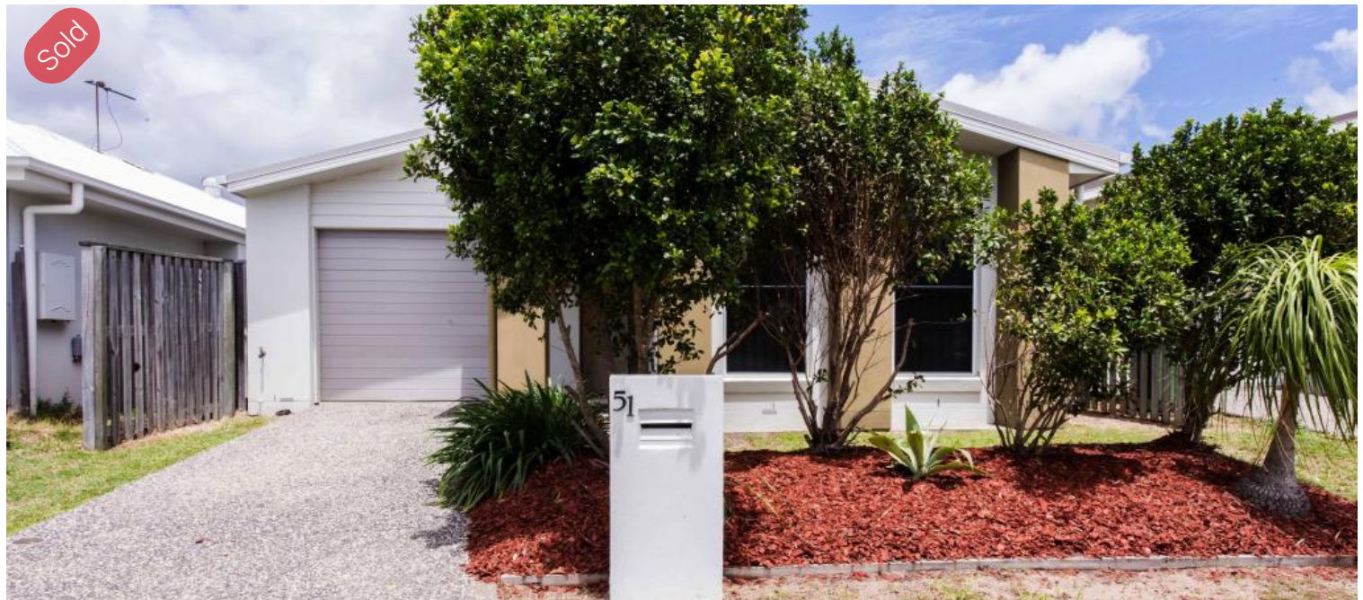
51 Scarborough Cct, Blacks Beach